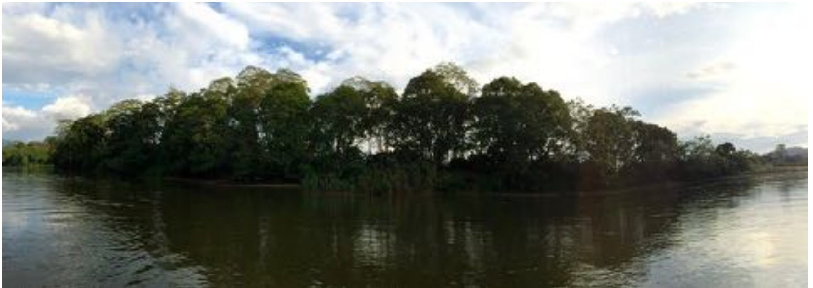
Wooded island for pre-release