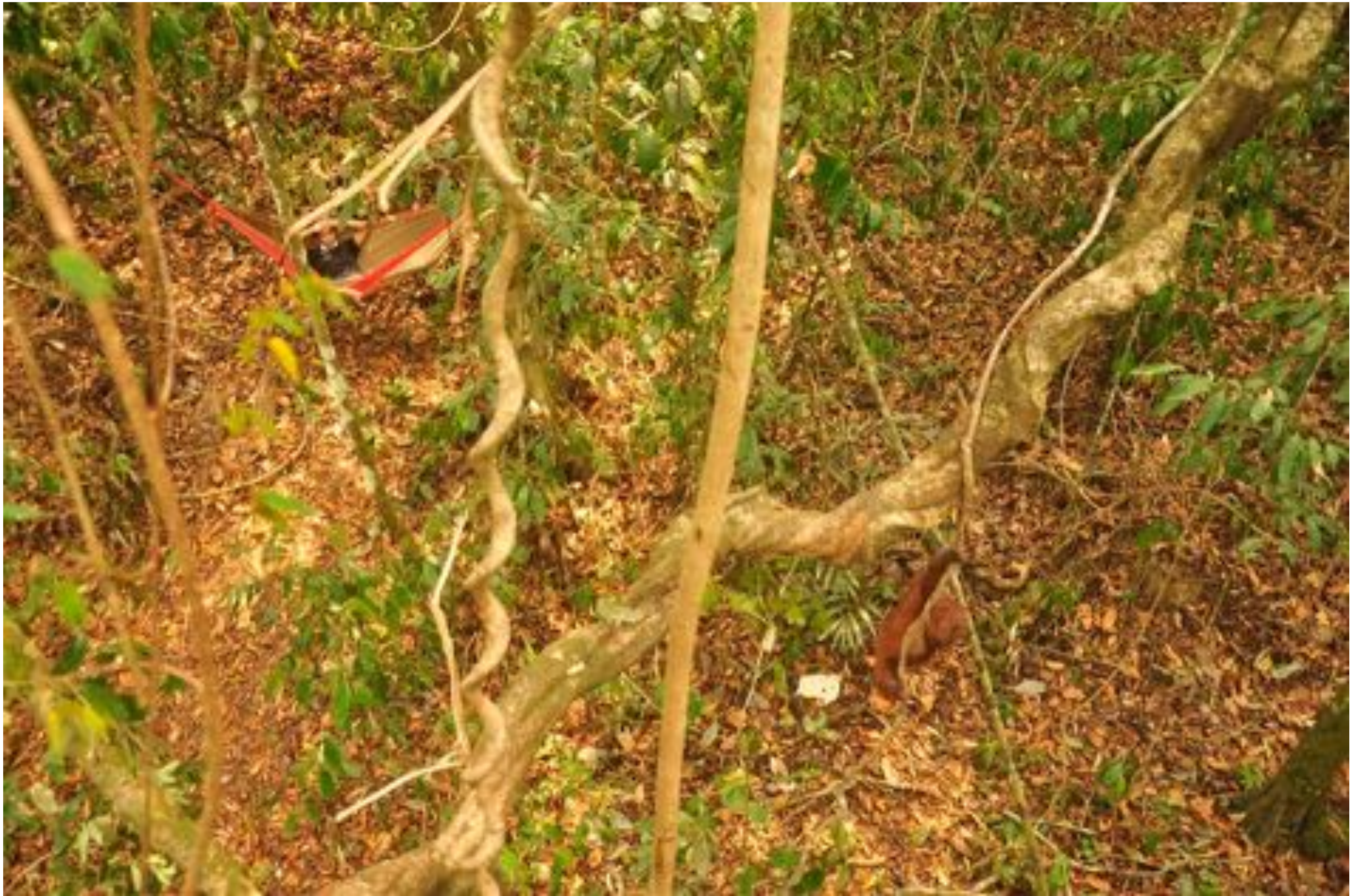
Forest School in which orangutans learn to be wild.