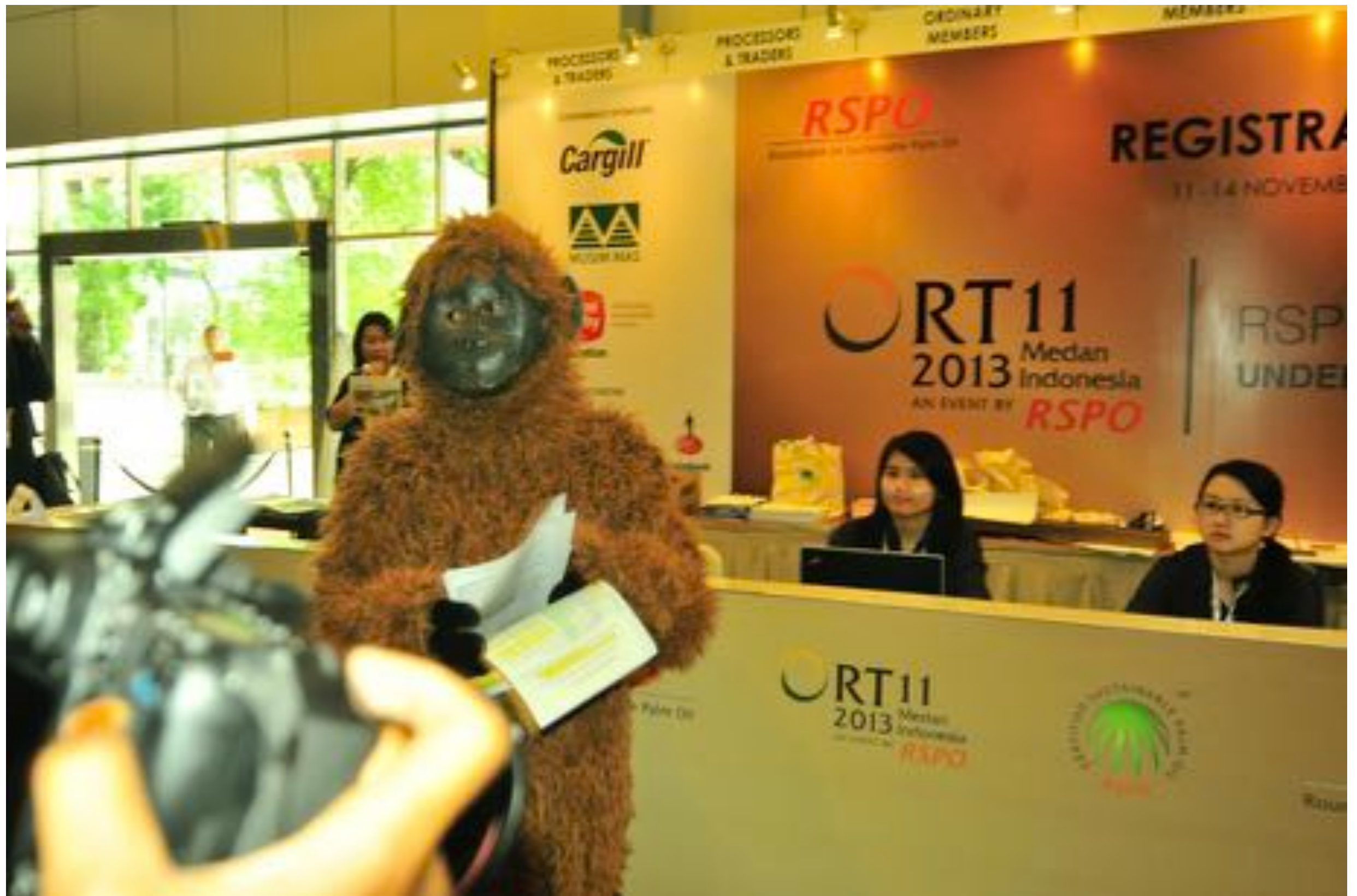
Demonstration in RSPO Meeting.