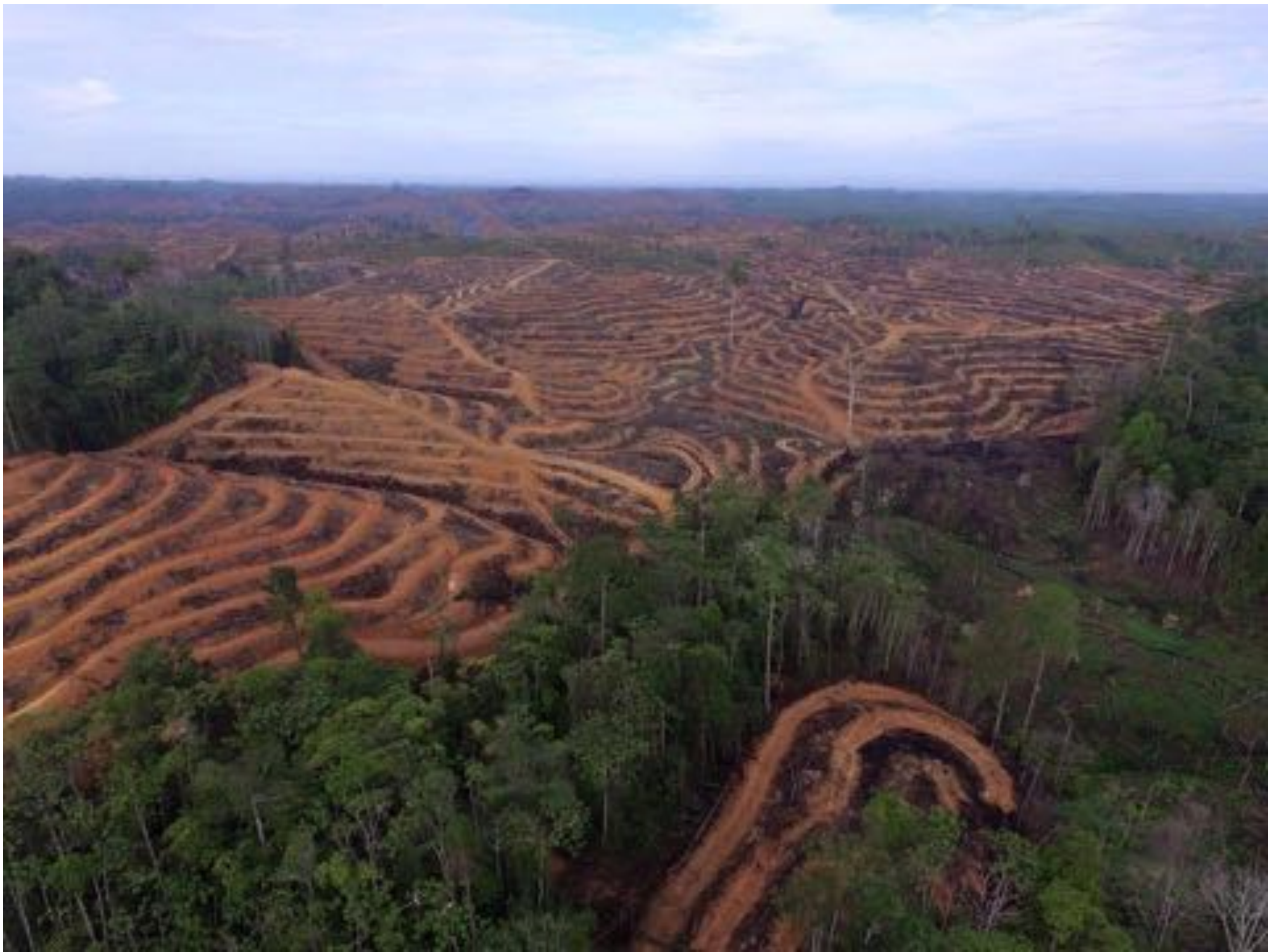
East Kutai, East Borneo, 2 weeks ago