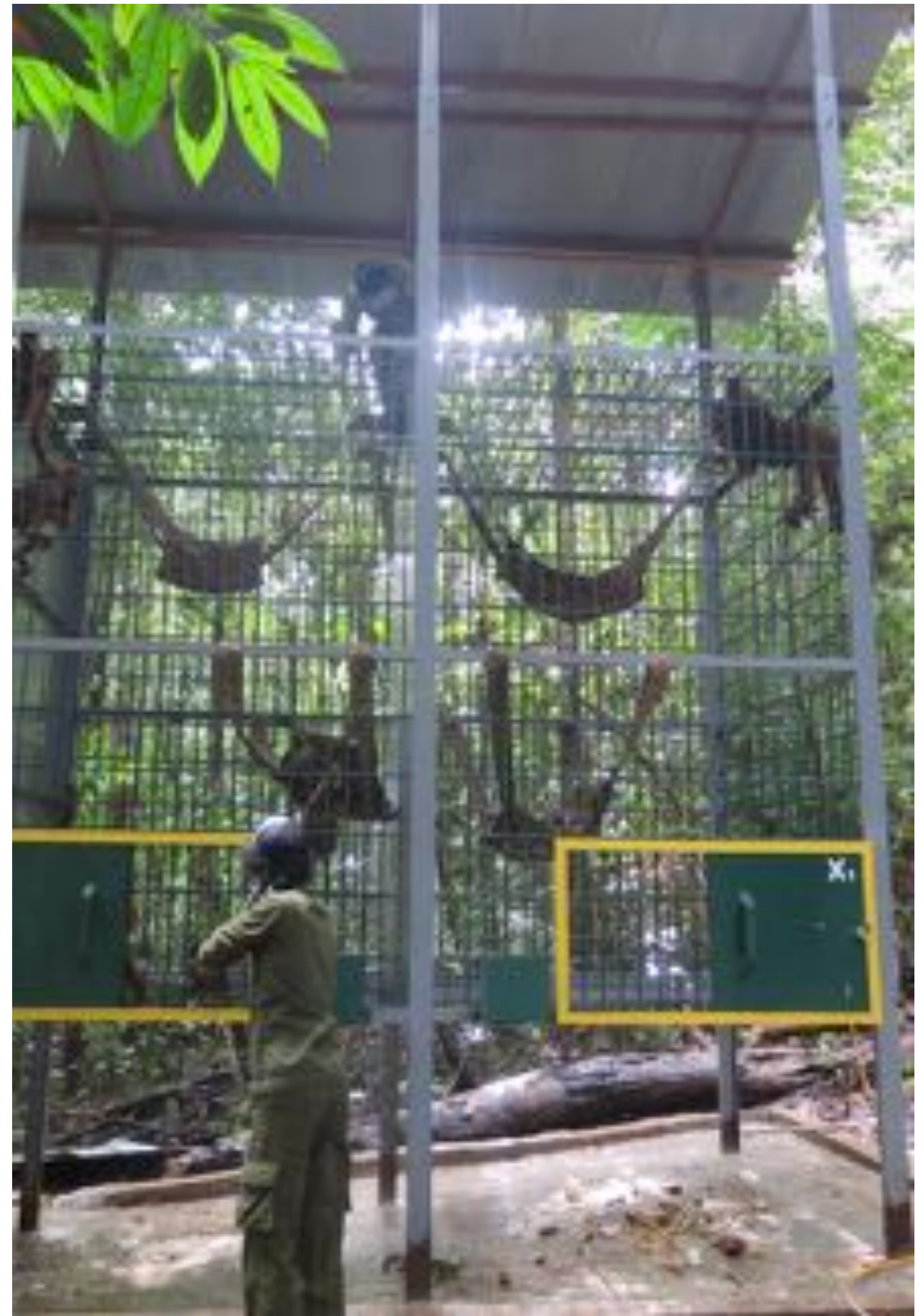
Orangutan Rehabilitation Center COP Borneo, Berau, East Borneo.