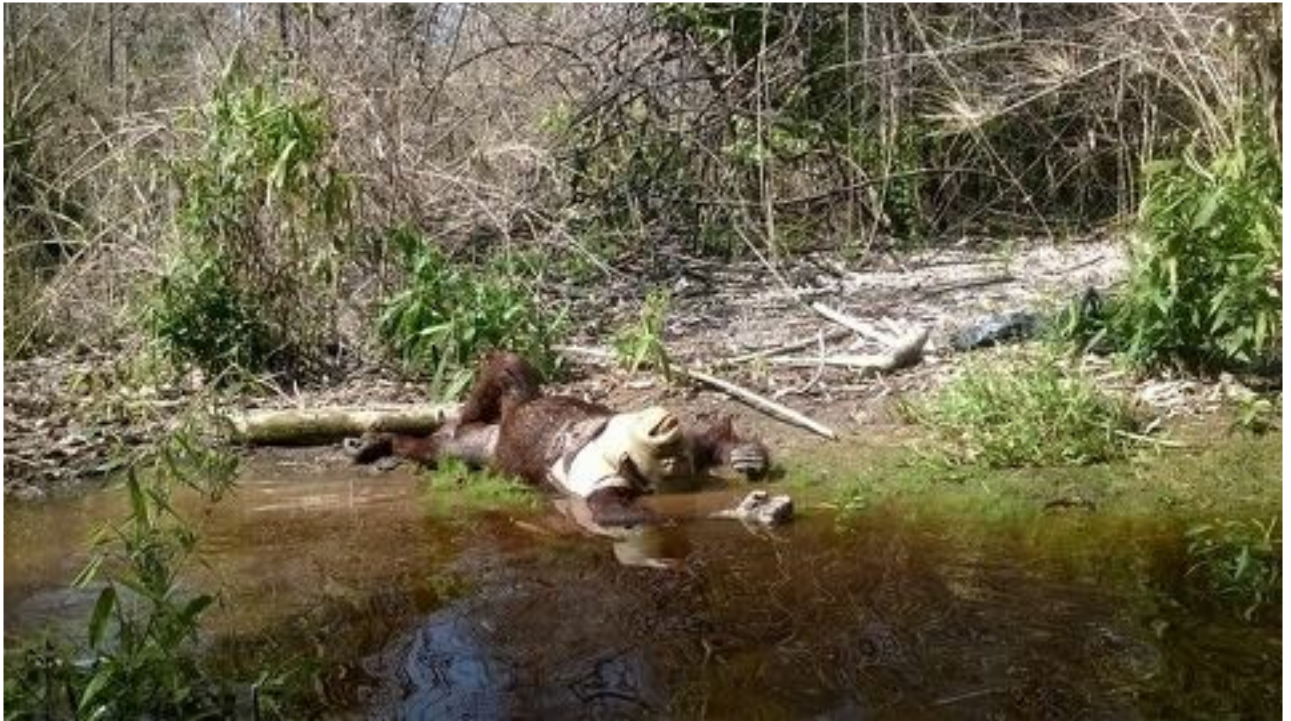
Orangutans were fragmented in the remaining forests that were not burned.