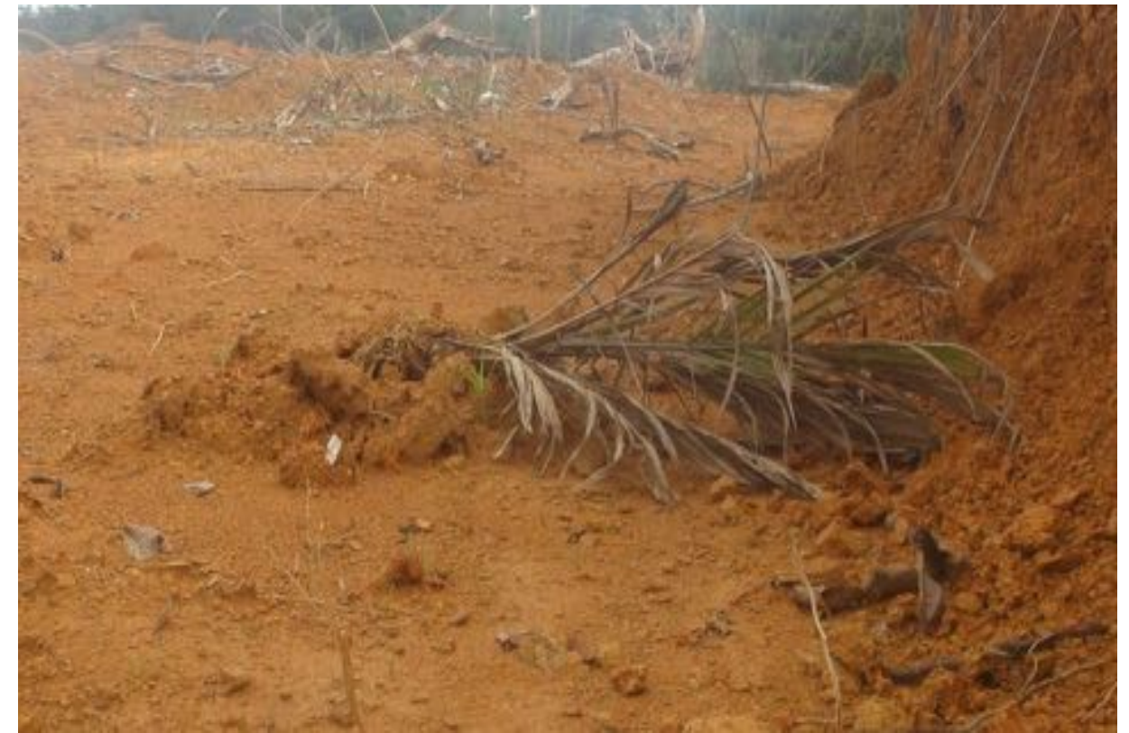
This was the situation and condition at PT Sabhantara Rawi Sentosa/ Makin Group area in West Kutai – East Borneo.