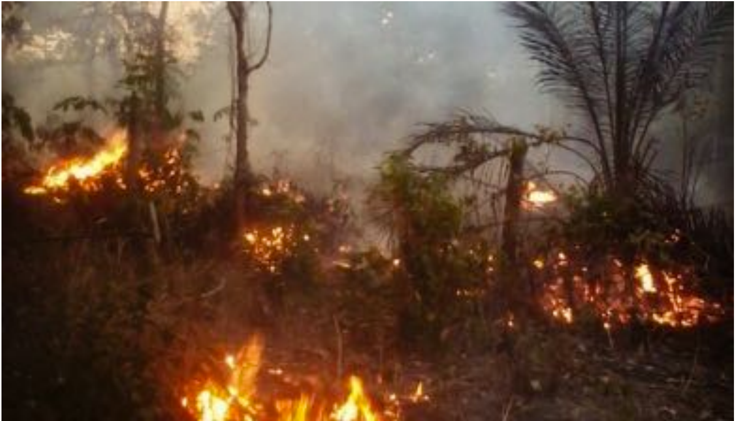
Forest burning for land clearing